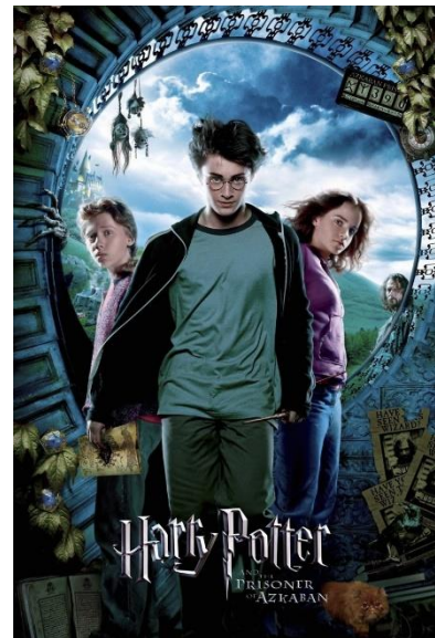
15. Harry Potter and the Prisoner of Azkaban