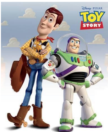
11. Toy Story