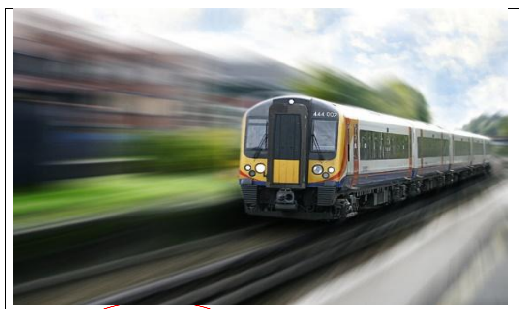
(1). Trains will be traveling at speeds of up to 150 miles per hour.

1.Look at the following pictures. They are predictions made by John E. Watkins in the year 1900. Describe them under each picture. (pair work)